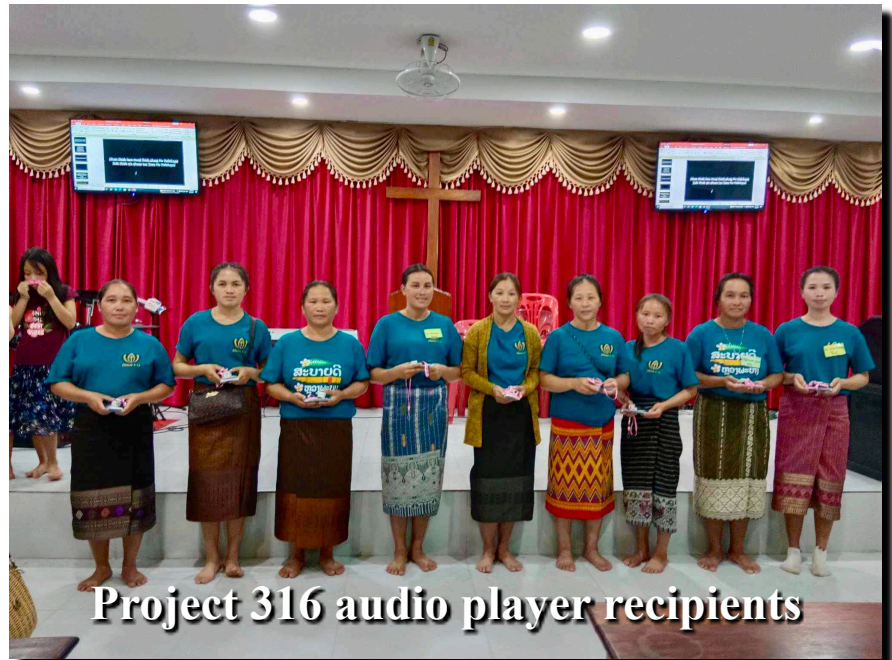
Project 316 audio player recipients